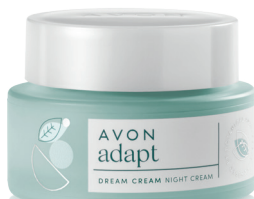
Dream Cream Night Cream helps double collagen production and calm skin

twice daily, massage into skin to swaddle thirsty cells with nourishment